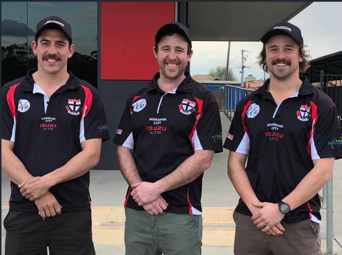
2023 HORSHAM SAINTS SENIOR FOOTBALL COACHES